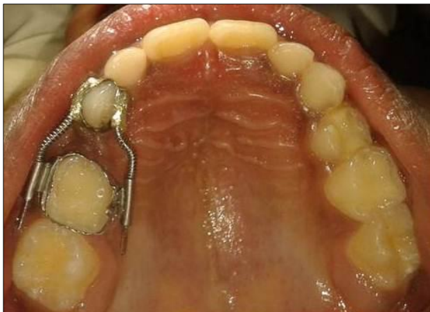
Figure 2: intraoral view of the appliance in place.

and palatally. The primary left canine was also banded ( 0.005 \times 0.180 in) with two stainless steel wires (0.7 mm width) soldered to it buccally and palatally, extending posteriorly to insert into the molar tubes of the primary second molar. NiTi open coil springs were cut 2-3mm longer than the distance between anterior stop (solder joints) and molar tubes posteriorly, and incorporated into the wires. The assembly was cemented on to the teeth with the springs held in compression to half their lengths (Figure 2). After 2 months, the space gained was 2.5 mm, hence the total space available between the primary left second molar and the primary left canine was 7 mm (Figure 3a, 3b). The appliance was replaced with a short band and loop soon after to maintain the regained space until the eruption of first premolar (Figure 4).