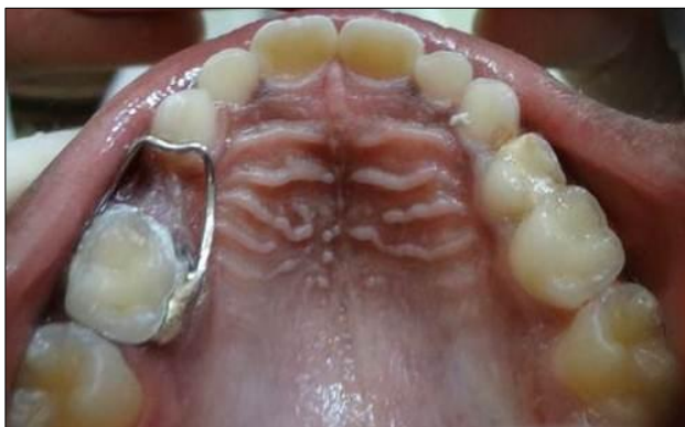
Figure 4: intraoral photograph showing cemented band and loop for further space maintenance.